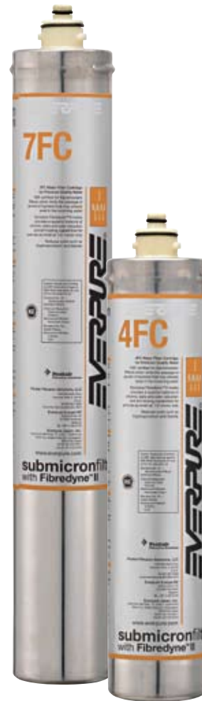
4FC Replacement Cartridge 1 PK: EV9692-21

Always flush the filter cartridge at time of installation and cartridge change.